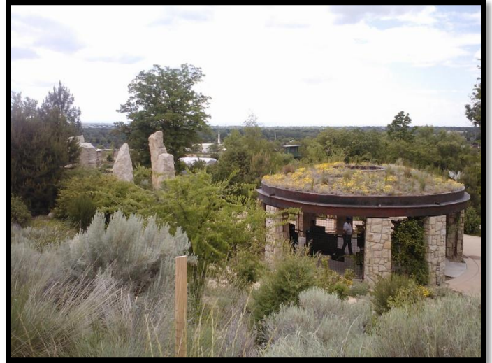
Idaho Botanical Gardens in May