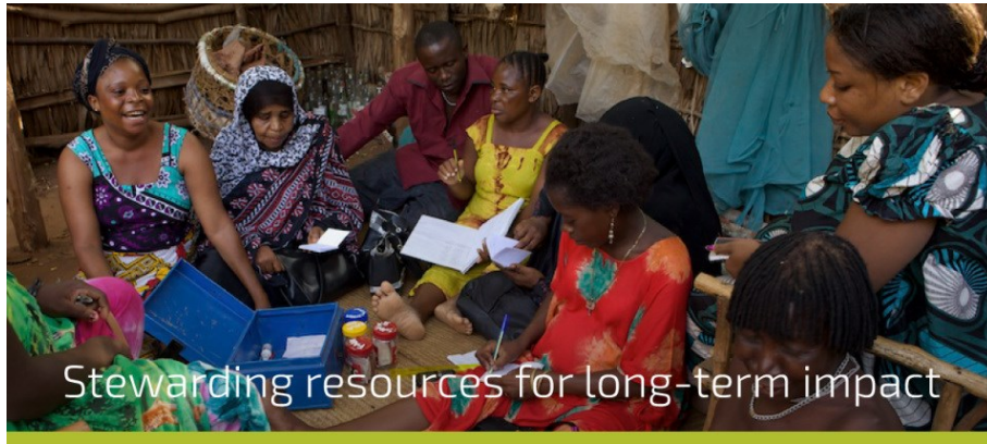
Stewarding resources for long-term impact

The IRPCV gives annual grants to nonprofit organizations in Idaho. The funds come from dues, calendar sales and contributions throughout the year. Distribution of the grants occurs following the annual meeting. In 2021 grants were given to agencies working with refugees and were awarded to the Agency for New Americans (Boise), Global Gardens (Boise) IRC (international Rescue Committee—Boise) and CSI (College of Southern Idaho) in Twin Falls. A total of $2100 was given. In the past four years, grants have also been given to Artisans for Hope, Girls on the Run, African Ladies in Idaho and Style Her Empowerment.